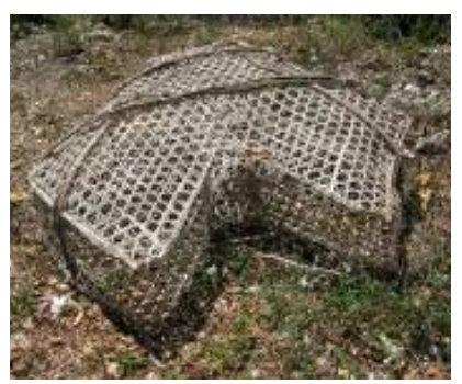
Traditional dema fish trap

The term 'fishery' is used both to mean the operation or industry of harvesting a fish stock, and the sub-population or 'stock' of fish being exploited. Fisheries involve either catching wild fish and shellfish from seas, lakes or rivers, or raising captive fish in farms (aquaculture). They can be in freshwater, but Zanzibar fisheries are mostly marine. They are classified by the type of fish harvested, the fishing method and gear type used, and the location where the fishery operates. Some fisheries are exploited for subsistence, some for commercial gain, and some for recreation.