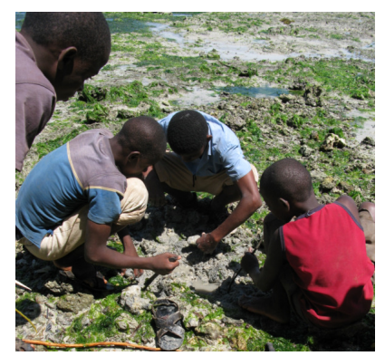
Children collecting shellfish on a Zanzibar beach

Pollution – Impacts of pollution on fisheries can be severe. Fish mistake plastic litter for food and eat it, where it blocks their guts and they starve. Untreated sewage contaminates seafood harvested from beaches and can spread deadly diseases such as cholera and typhoid. Toxic chemicals leach from rubbish dumps, farms using chemical fertilizers and pesticides, and burn sites into the sea, where they build up in the tissues of marine organisms through what they eat. They cause infertility, cancers and other diseases in both fish and humans, and can be fatal. Toxin levels build up the higher you go up the food chain, and so do their effects, including on people who eat contaminated fish. Children are particularly at risk.