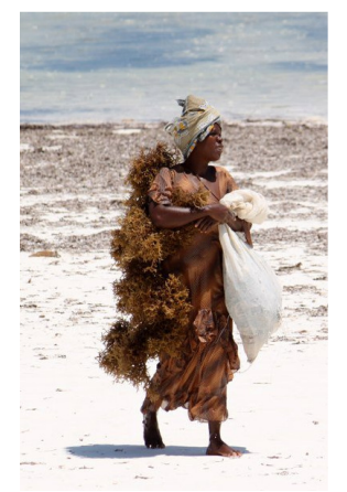
Zanzibar seaweed farmer

Pearl farming: Local communities in the Fumba peninsula farm oysters for pearls. The market for