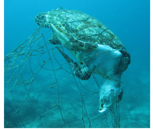
Critically endangered hawksbill turtle caught and killed by an abandoned net in Zanzibar

Abandoned nets – If a fisher loses a madema because the marker buoy breaks off, then the trap, made from natural materials, will eventually disintegrate. However, modern nets are made from materials which do not break down, so if they are lost, the net continues to catch and kill marine life for centuries.